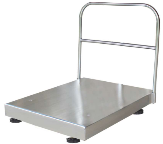
Stainless Steel Platform