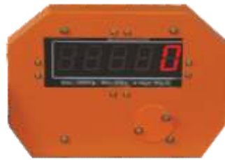
Thermal Scale with cover