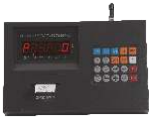
Wireless Remote Indicator with Printer (Option)