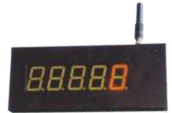
Wireless Remote Display (Option)