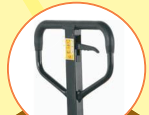
Three Lever Positions handle controls

The spring loaded handle automatically returns to vertical position when not in use. The chrome plated hydraulic pump piston provides long seal life.