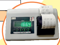
In Built Receipt Printer