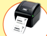
DA 200 Series Printer