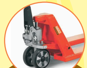
Compact, Unique Sealed Dust Free Hydraulic System