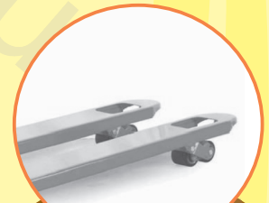
SS Fork Pallet